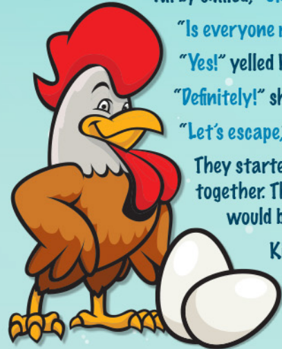
Answer: Roosters don't lay eggs.